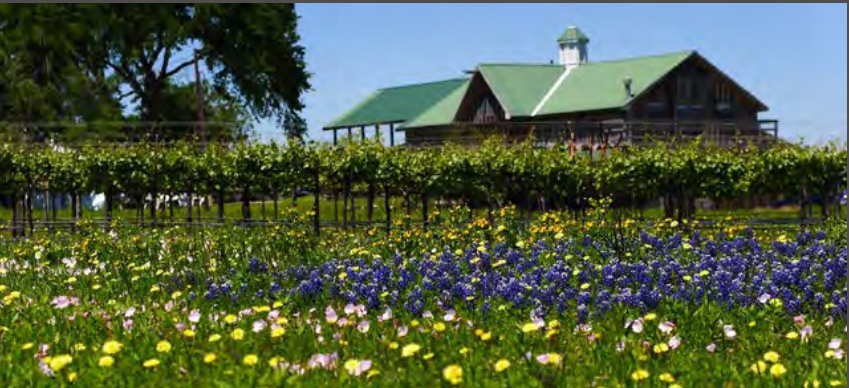
Pleasant Hill Winery