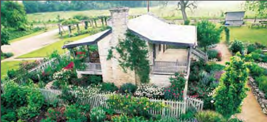
Antique Rose Emporium