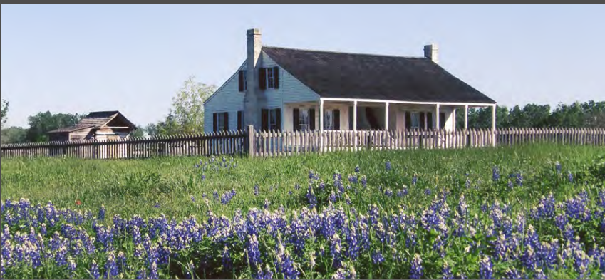
Washington on the Brazos State Park

There is definitely rest for the weary at the lovely Inn at Dos Brisas, located in the picturesque Texas countryside just west of Houston. Dos Brisas is the only Forbes 5-star rated restaurant in Texas. The restaurant is reason alone to journey to this rustic ranch resort – the chef prepares masterful creations, many sourced from the Inn's own organic gardens. The haute cuisine is a little bit French and a little bit country, with dishes such as poached pheasant with black-eyed pea cassoulet and chilled lobster with Texas Rio-star grapefruit. The extensive wine list includes more than 3,500 different vintages.