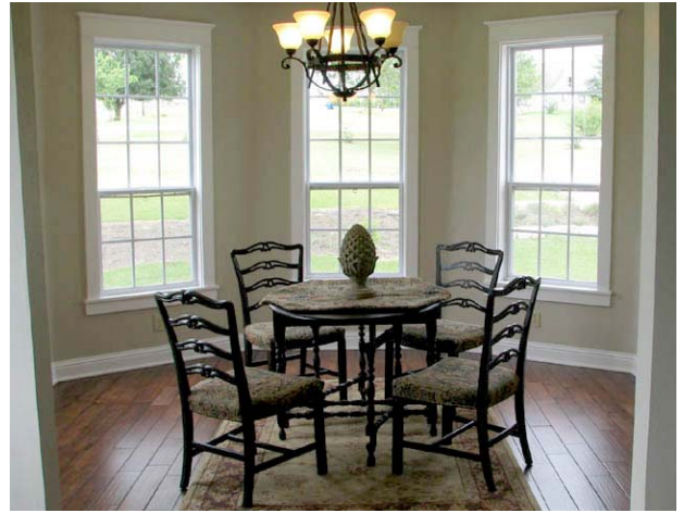
Hand-Scraped Walnut Floors ★ Breakfast Area Has Large Picture Window For Abundant Light Formal Dining has Bay Window, Updated Light Fixture, Baseboards, Windows & Trim