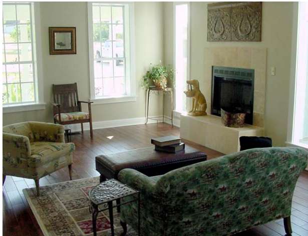
Light & Bright Living Area ★ Neutral Colors to Fit Any Décor Open Floor Plan ~ Great For Entertaining Guests Hand-Scraped Walnut Floors ★ Limestone Fireplace Beamed Ceiling Creates A Country Flare Updated Ceiling Fan, Windows, Trim & Baseboards