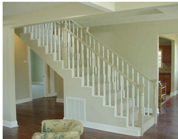
A Bonus Area With Electrical Outlet Is Located Under The Staircase This Creates A Cozy Area for a Computer Or Library