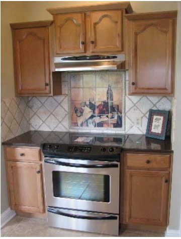
Mocha-Glazed Maple Savannah Cabinets from Lowe's Granite Countertops Tumbled Marble Backsplash Stainless Under-Mount Sink, Dishwasher & Stove w/Vent Hood 16" Tile Floors Over Cement Board Updated Light Fixtures, Bronze Hardware, Windows, Baseboards & Trim