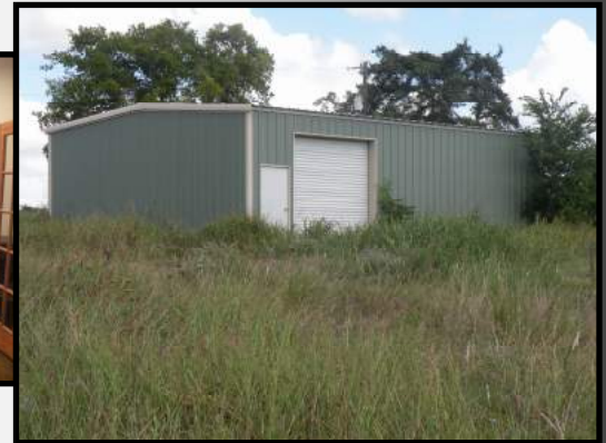
Metal Shop Building