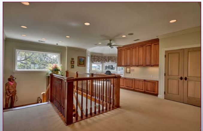
Second Floor View of Office Area