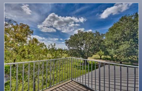
Office Balcony View Right