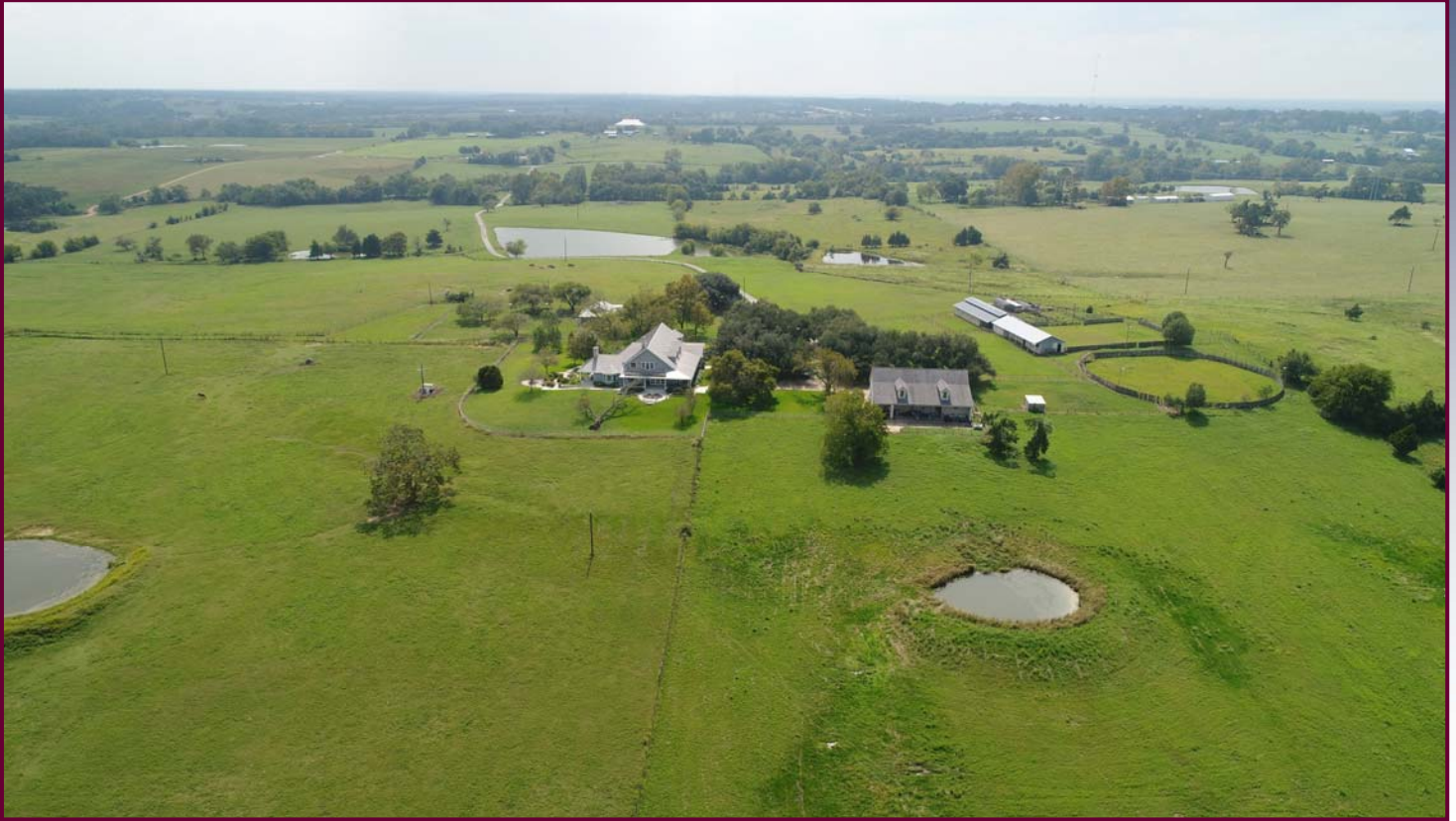
Aerial of Main House, Barns, Detached Garage and 2 Ponds