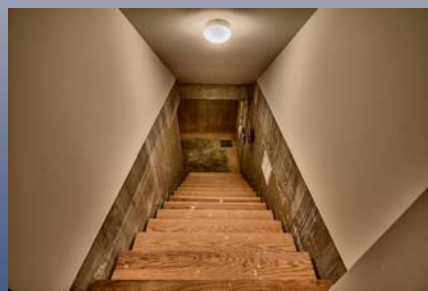
Stairs to Basement