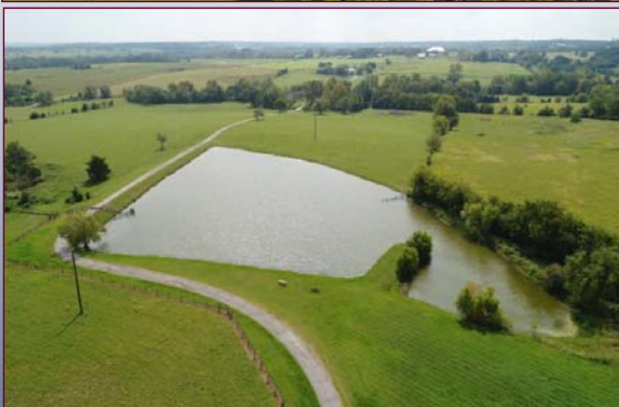
Aerial View of Property Entrance and Driveway