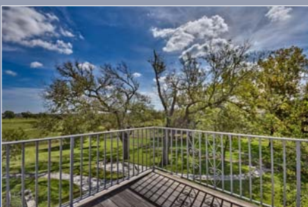
Office Balcony View Left