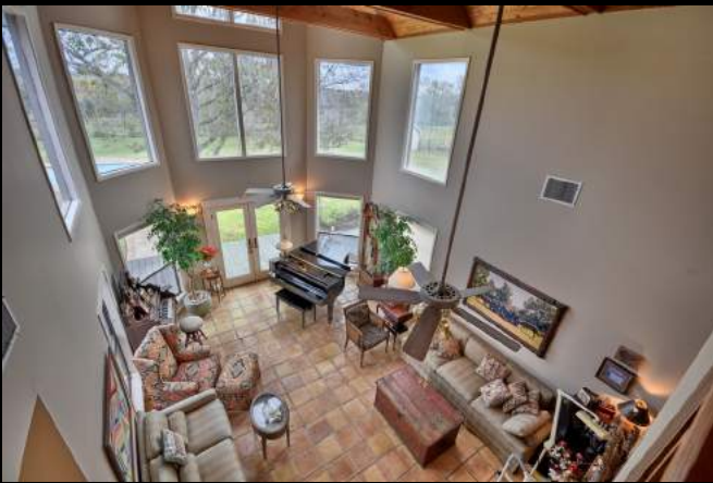
Balcony view of Living Area