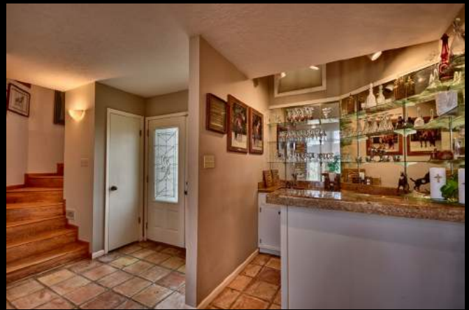
Entry Way Bar